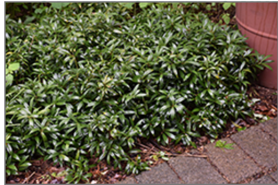
Himalayan Sweet Box

Himalayan Sweet Box will grow to be about 24 inches tall at maturity, with a spread of 24 inches. It has a low canopy. It grows at a medium rate, and under ideal conditions can be expected to live for approximately 30 years.