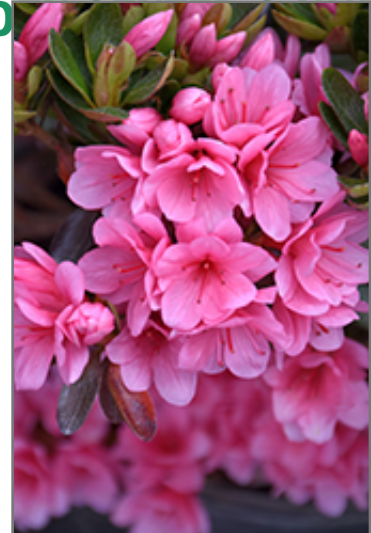
Coral Bells Azalea flowers

Coral Bells Azalea will grow to be about 3 feet tall at maturity, with a spread of 4 feet. It tends to be a little leggy, with a typical clearance of 1 foot from the ground. It grows at a slow rate, and under ideal conditions can be expected to live for 40 years or more.