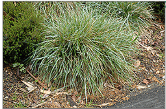
Blue Moor Grass

Blue Moor Grass will grow to be about 10 inches tall at maturity extending to 15 inches tall with the flowers, with a spread of 12 inches. Its foliage tends to remain low and dense right to the ground. It grows at a medium rate, and under ideal conditions can be expected to live for approximately 10 years. As an evergreen perennial, this plant will typically keep its form and foliage year-round.