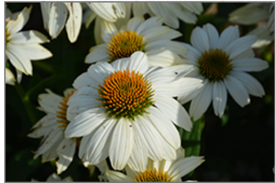
PowWow White Coneflower flowers