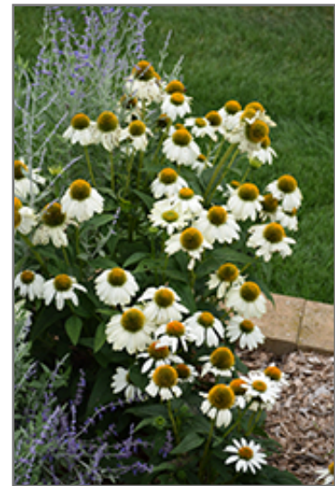
PowWow White Coneflower in bloom