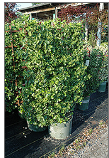
Manhattan Spreading Euonymus