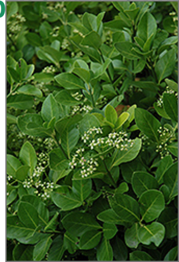
Manhattan Spreading Euonymus flowers