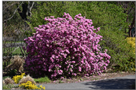
P.J.M. Elite Rhododendron in bloom