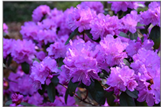
P.J.M. Elite Rhododendron flowers