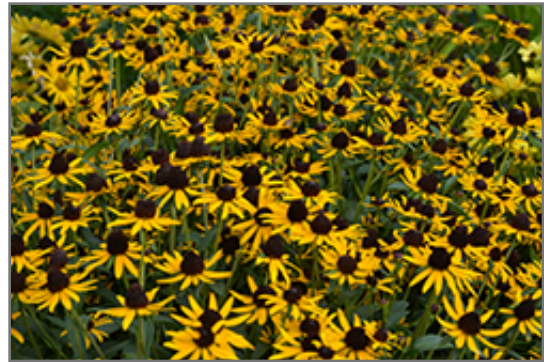
Little Goldstar Coneflower flowers