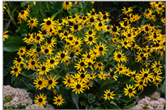
Little Goldstar Coneflower in bloom