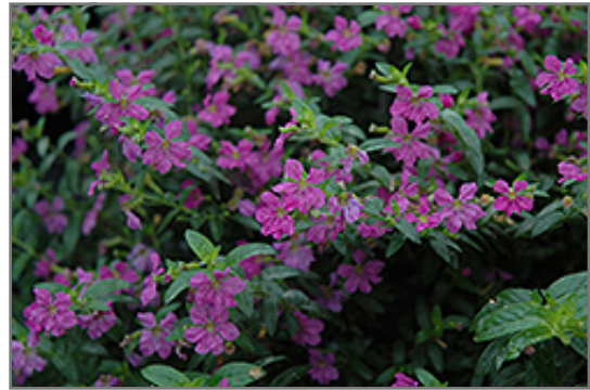
Allyson Mexican Heather flowers

Allyson Mexican Heather will grow to be about 24 inches tall at maturity, with a spread of 24 inches. Its foliage tends to remain dense right to the ground, not requiring facer plants in front. Although it's not a true annual, this fast-growing plant can be expected to behave as an annual in our climate if left outdoors over the winter, usually needing replacement the following year. As such, gardeners should take into consideration that it will perform differently than it would in its native habitat.