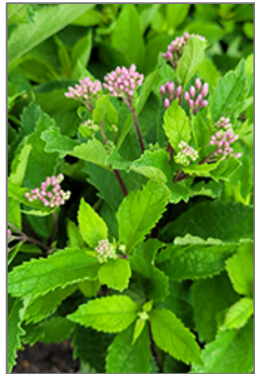
Phantom Joe Pye Weed flower buds