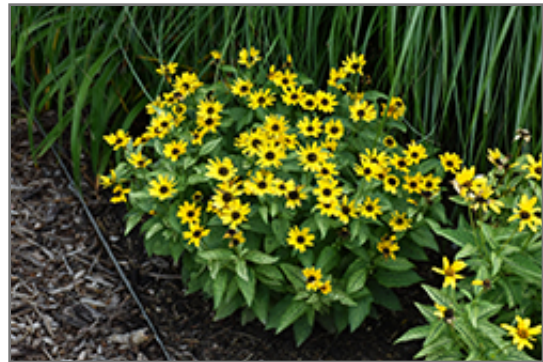
Sunburst False Sunflower in bloom