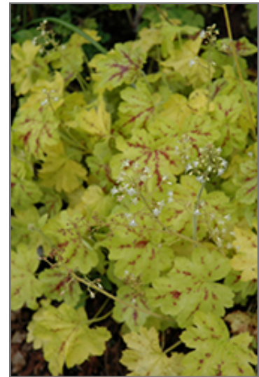
Solar Power Foamy Bells flowers