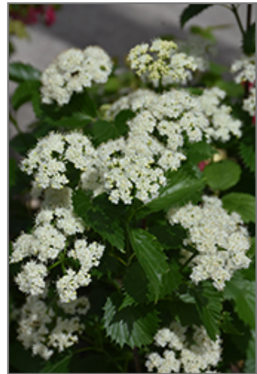
Blue Muffin Viburnum flowers