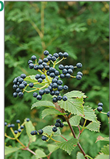
Blue Muffin Viburnum fruit

Blue Muffin Viburnum will grow to be about 8 feet tall at maturity, with a spread of 7 feet. It tends to be a little leggy, with a typical clearance of 2 feet from the ground, and is suitable for planting under power lines. It grows at a medium rate, and under ideal conditions can be expected to live for 40 years or more.