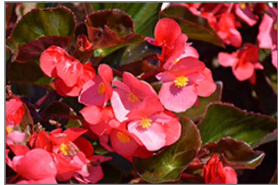
Whopper Rose Bronze Leaf Begonia flowers