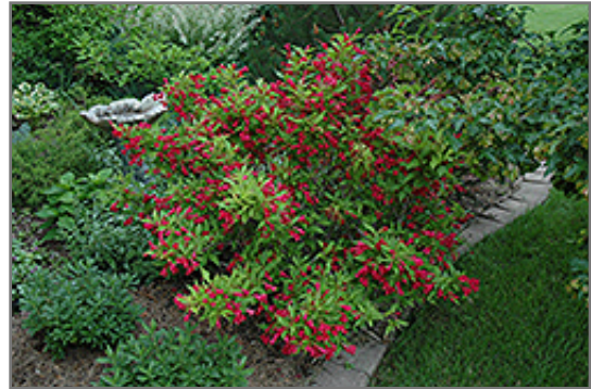
Red Prince Weigela in bloom