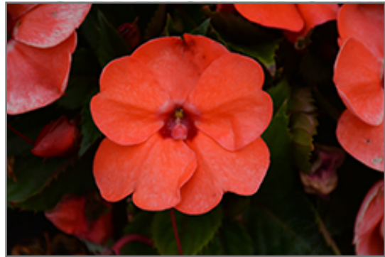
SunPatience Compact Hot Coral New Guinea Impatiens flowers