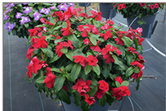
Titan Dark Red Vinca in bloom