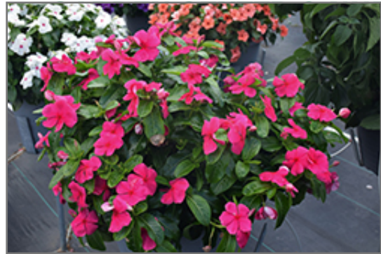
Titan Punch Vinca in bloom

Titan Punch Vinca is a fine choice for the garden, but it is also a good selection for planting in outdoor containers and hanging baskets. It is often used as a 'filler' in the 'spiller-thriller-filler' container combination, providing a mass of flowers against which the thriller plants stand out. Note that when growing plants in outdoor containers and baskets, they may require more frequent waterings than they would in the yard or garden.