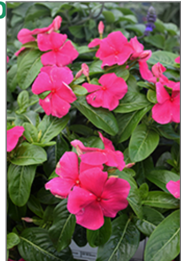
Titan Punch Vinca flowers