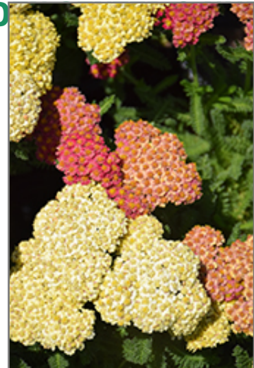
Desert Eve Terracotta Yarrow flowers