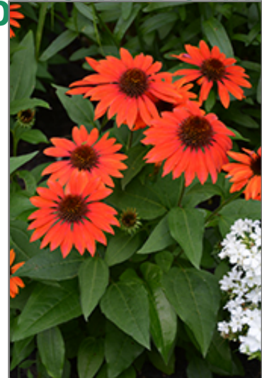
Sombbrero Flamenco Orange Coneflower in bloom