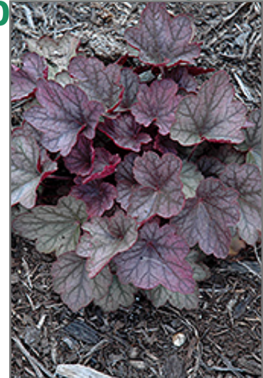
Carnival Rose Granita Coral Bells foliage