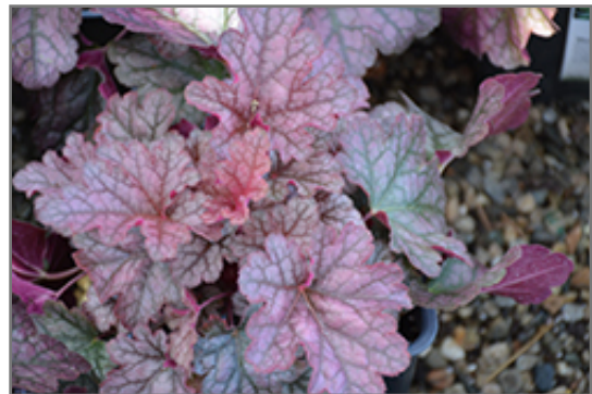
Kira Purple Rain Forest Coral Bells foliage