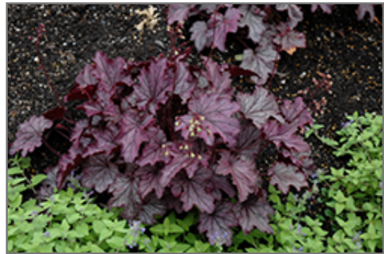
Spellbound Coral Bells