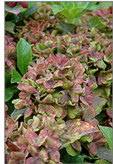
Pistachio Hydrangea flowers