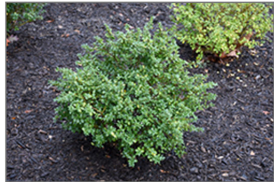
Green Lustre Japanese Holly