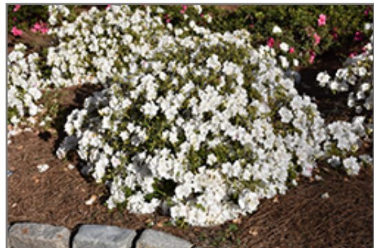
Encore Autumn Starlite Azalea in bloom