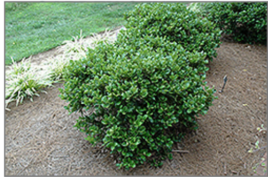
Carissa Holly

Carissa Holly will grow to be about 4 feet tall at maturity, with a spread of 4 feet. It has a low canopy. It grows at a medium rate, and under ideal conditions can be expected to live for 50 years or more.