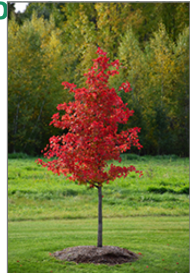
Wildfire Black Gum in fall

Wildfire Black Gum will grow to be about 50 feet tall at maturity, with a spread of 30 feet. It has a low canopy with a typical clearance of 3 feet from the ground, and should not be planted underneath power lines. It grows at a slow rate, and under ideal conditions can be expected to live for 70 years or more.