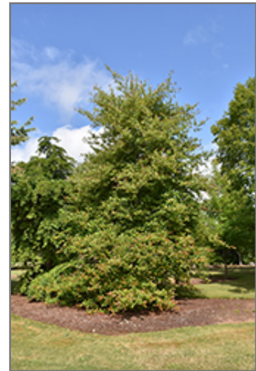
Wildfire Black Gum