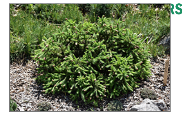
Pusch Spruce