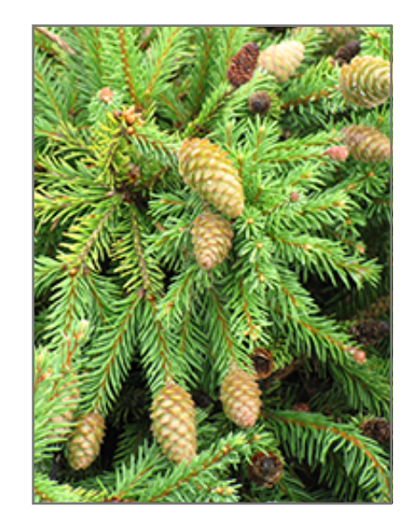
Pusch Spruce foliage