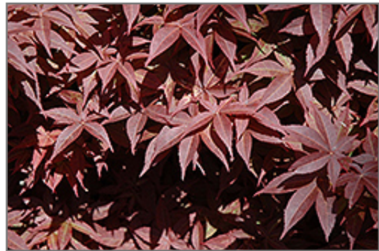
Rhode Island Red Japanese Maple foliage