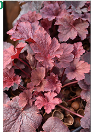
Cajun Fire Coral Bells foliage