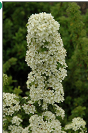
Teton Scarlet Firethorn flowers

Teton Scarlet Firethorn will grow to be about 15 feet tall at maturity, with a spread of 15 feet. It tends to be a little leggy, with a typical clearance of 1 foot from the ground, and is suitable for planting under power lines. It grows at a medium rate, and under ideal conditions can be expected to live for 40 years or more.