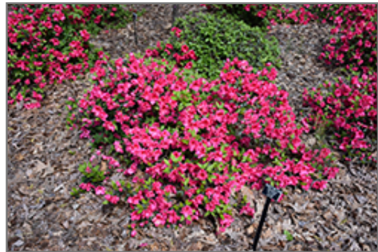
Red Ruffles Azalea in bloom