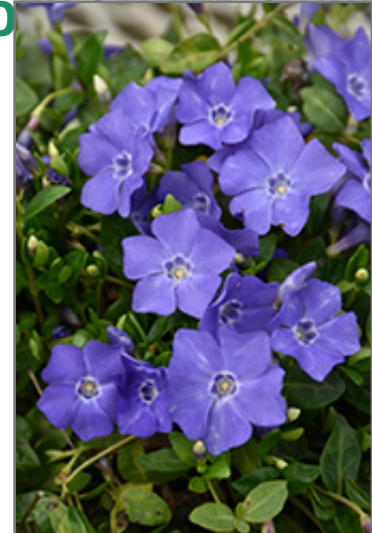
Bowles Periwinkle flowers