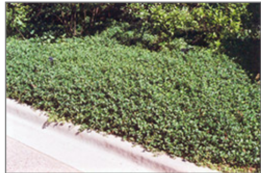
Bowles Periwinkle