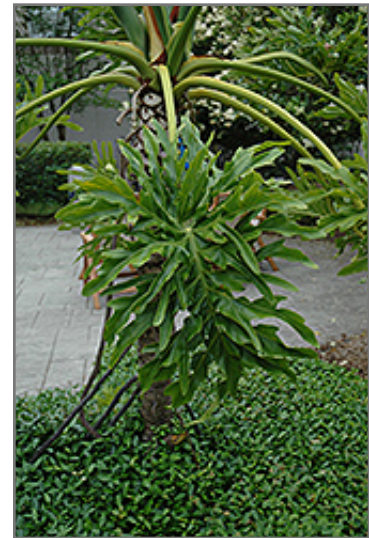
Tree Philodendron foliage