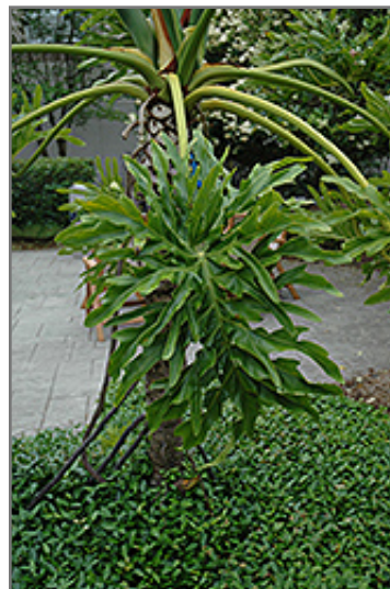
Tree Philodendron foliage