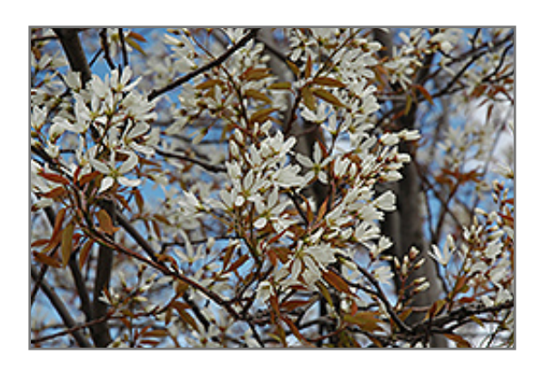
Autumn Brilliance Serviceberry flowers

Autumn Brilliance Serviceberry is recommended for the following landscape applications;