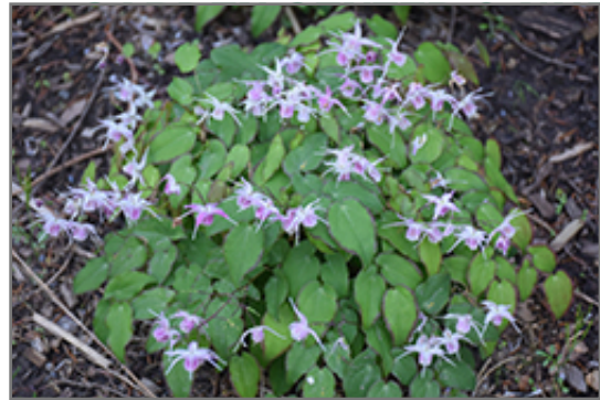
Queen Esta Bishop's Hat in bloom