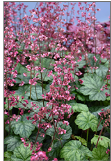
Berry Timeless Coral Bells flowers