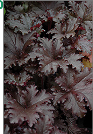
Black Taffeta Coral Bells foliage