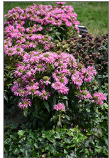
Pardon My Pink Beebalm in bloom