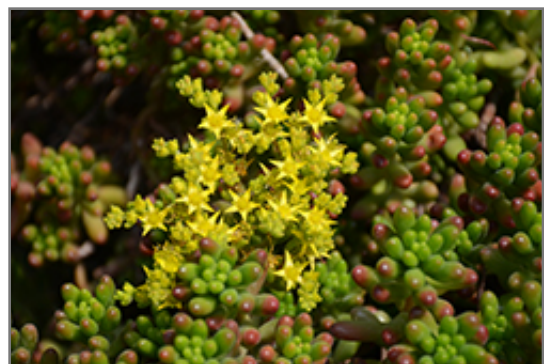
Jelly Bean Plant flowers