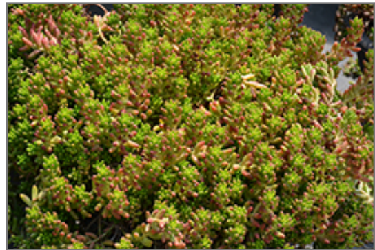
Jelly Bean Plant