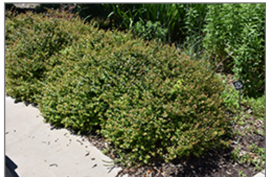
Rose Creek Abelia