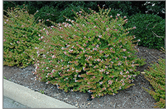
Rose Creek Abelia in bloom