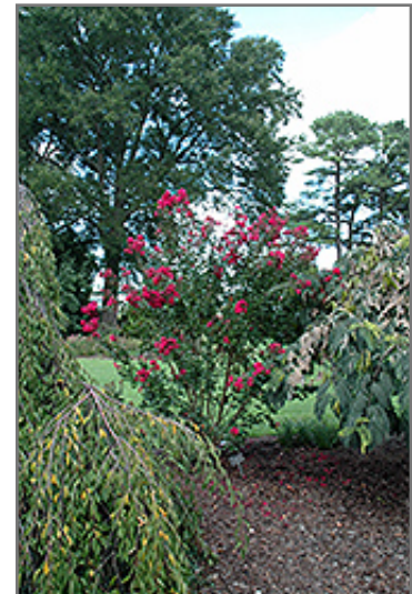
Pink Velour Crapemyrtle in bloom