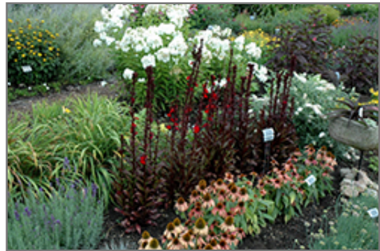
Vulcan Red Lobelia in bloom