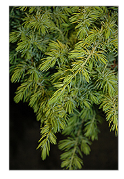
Golden Pacific Shore Juniper foliage