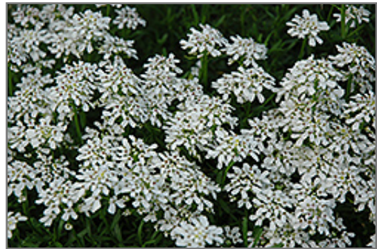
Little Gem Candytuft flowers