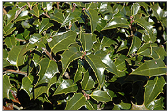
Dragon Lady Holly foliage