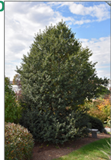
Dragon Lady Holly

Dragon Lady Holly will grow to be about 20 feet tall at maturity, with a spread of 6 feet. It has a low canopy, and is suitable for planting under power lines. It grows at a slow rate, and under ideal conditions can be expected to live for 50 years or more.