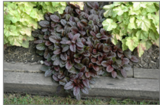
Mahogany Bugleweed