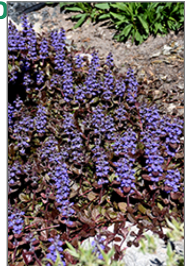
Mahogany Bugleweed flowers

Mahogany Bugleweed is recommended for the following landscape applications;