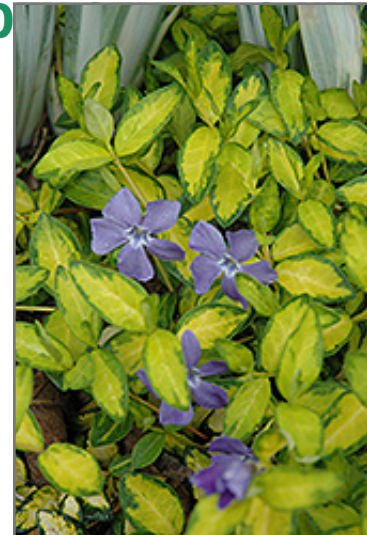
Illumination Periwinkle flowers