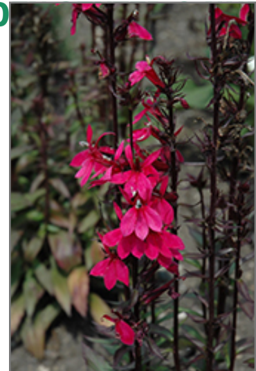
Starship Deep Rose Lobelia flowers