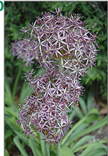
Star Of Persia Onion flowers

Star Of Persia Onion will grow to be about 12 inches tall at maturity extending to 24 inches tall with the flowers, with a spread of 12 inches. It grows at a medium rate, and under ideal conditions can be expected to live for approximately 5 years. As an herbaceous perennial, this plant will usually die back to the crown each winter, and will regrow from the base each spring. Be careful not to disturb the crown in late winter when it may not be readily seen! As this plant tends to go dormant in summer, it is best interplanted with late-season bloomers to hide the dying foliage.